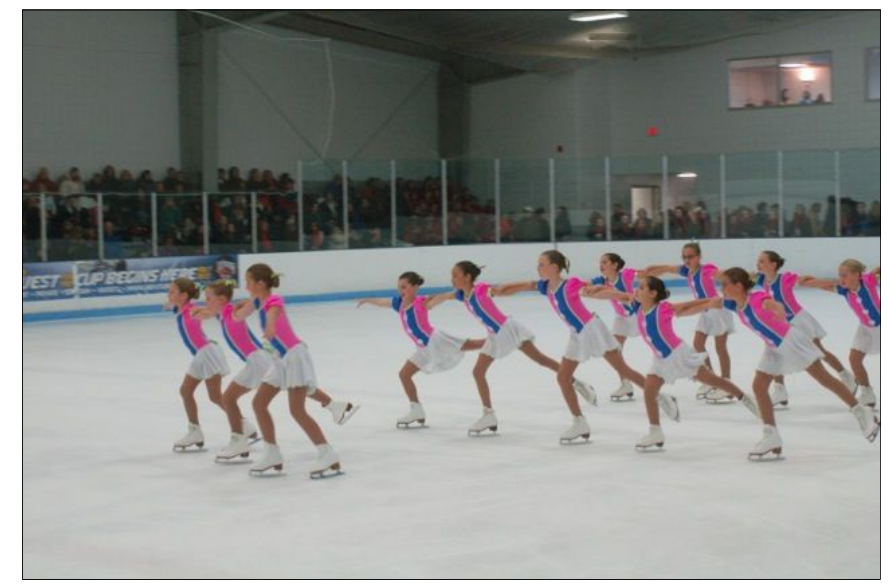
Pewter Medalists Excel Crystals (Preliminary Division), competing at the annual Thanksgiving Classic

The Preliminary and Juvenile lines exhibited at the Frog Pond Skating Spectacular at the annual Boston Common Tree Lighting on November 29.