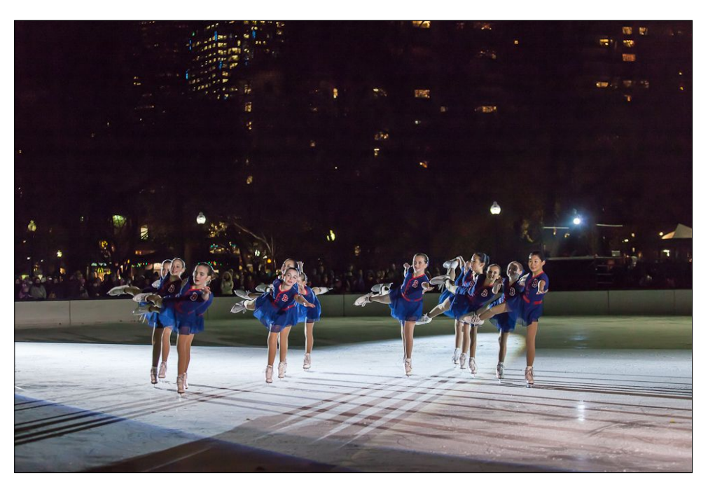
Team Excel Juvenile

For more information about The Boston Common Frog Pond and other local Club activities, see the related article, "Skating Club – of Boston and Beyond" on page 4.