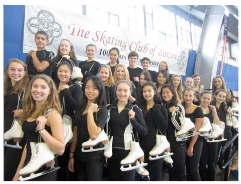
Junior Activities Committee members with their collected skates

Kudos to The Junior Activities Committee (JAC) for their successful skate drive! More than 85 pairs of gently used skates were generously donated by Club members and Skaters Landing. The JAC thanks everyone for their kindness and support.