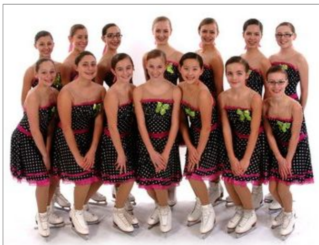
Intermediate team, 2013 Eastern Sectional competitors

The expansion of the Elite level reflects the program's growing reputation. We are proud to include high school, college, and post-college skaters who hail from not only New England, but around the country. For more information on Team Excel, check the team's website at: www.excelsynchro.org or send an email to: excelsynchro@gmail.com