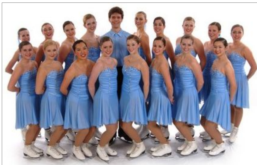
Senior team, 2013 Eastern Sectional champions

The Club now supports 10 synchro teams, aimed at three distinct skater markets: Introductory, Qualifying, and Elite.