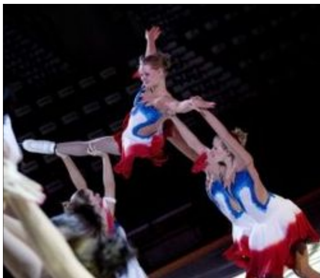
Marigold IceUnity, from Finland, 2012 World Synchronized Skating Champions, will headline this year's Ice Chips