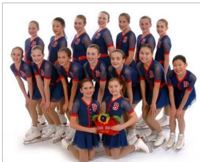
Juvenile team, 2013 Eastern Sectional competitors