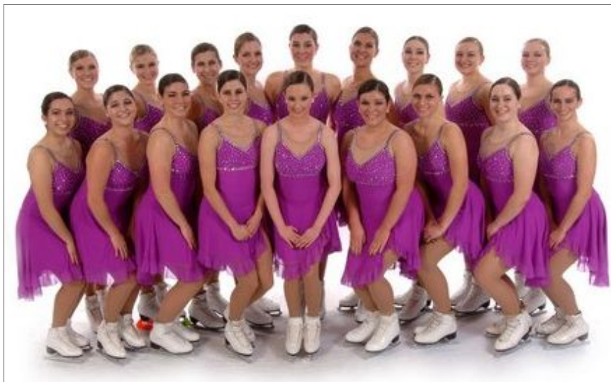
Collegiate team, 2013 Eastern Sectional champions