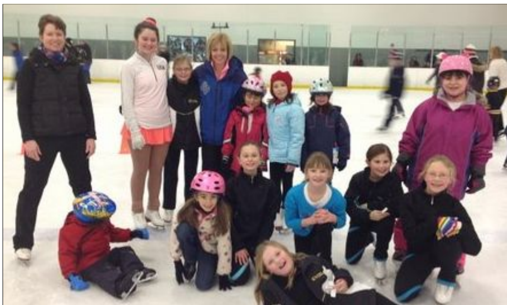
Skaters relaxing after show