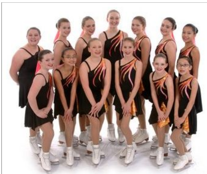
Pre-Juvenile team, 2013 Eastern Sectional competitors

The other differentiating aspect of synchronized skating is the teamwork. To be successful, all 16 skaters need to be focused and the team depends on everyone to attend every practice to be able to perfect elements. When the team skates well at a competition, regardless of the outcome, there's something incredibly special and memorable about sharing that sense of accomplishment with others.