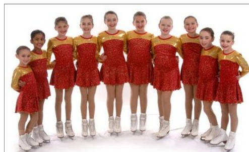
Team Excel Crystals White, Beginner 1 team