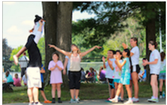
Summer Camp off-ice training