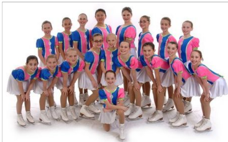
Preliminary team, 2013 Eastern Sectional competitors