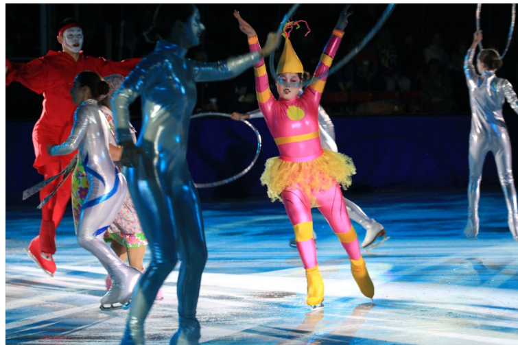
ACT I of Boston