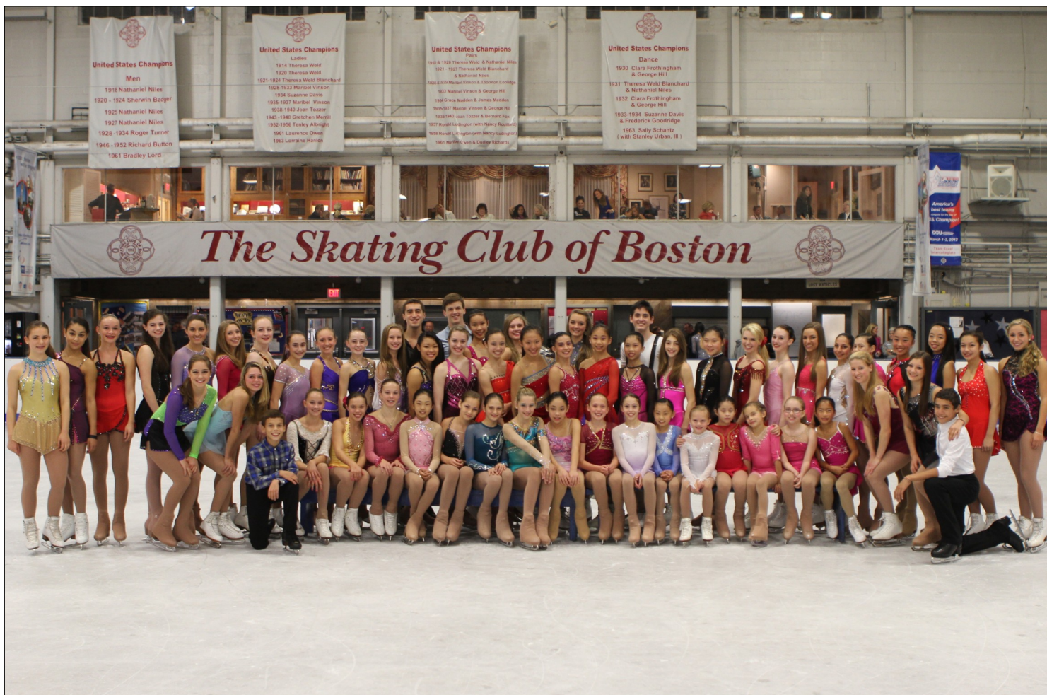
2012 New England Regional competitors—Boston

Club members competing in this year's New England Regionals are listed on the following page.