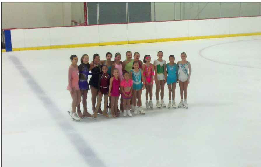
Skaters delight in Marlborough summer exhibition