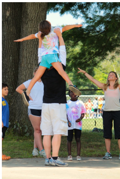
Summer Camp off-ice training

However, the campers' highlights took place in the ice rink. The development of skating skills in fun, age- and skating-level-appropriate groups, and the opportunities to experience choreography, skating with “props”—think hats and other costume pieces, foam noodles, and much more—made it easy to see why the on-ice activities were so popular.