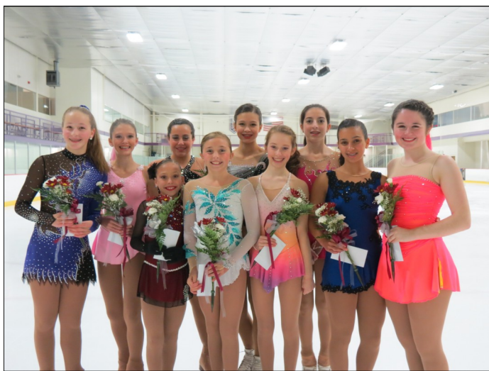
2012 New England Regional competitors—Marlborough

The Skating Club of Boston is proud to send 97 competitors to this year's New England Regional Championships, October 12–16, in Warwick, RI. Winners and other medalists will go on to compete at next month's Eastern Sectionals in Hyannis.