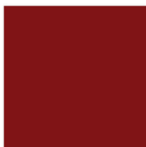
CRIMSON Primary Pantone 202C Hex 800000 RGB 128, 0, 0 CMYK 29, 100, 100, 38